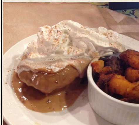
Pictured: PB&J French Toast with a side of seasoned potatoes

Don't forget that our famous French toast (in 9 delicious flavors) is now served from opening to closing! It's a perfect treat for breakfast, lunch, or as a dessert!